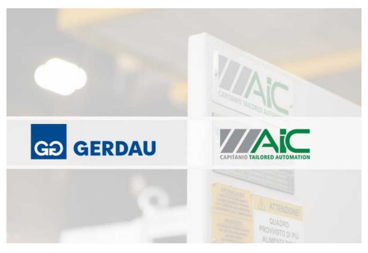
Figure 1 – AIC craftsmanship panel developed, as reference.

The intervention is part of the client's strategy for a package of investments aimed at expanding the merchant bar product range and operational competitiveness of the location, while improving the flexibility of Gerdau's plant network.