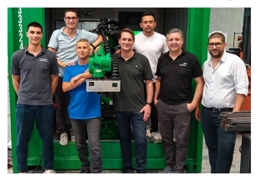
Figure 1 - Teams from AIC and ArcelorMittal Acindar after the FAT.

The delight of the Acindar and AIC Group teams was celebrated at the end of the tasks (Fig.1).