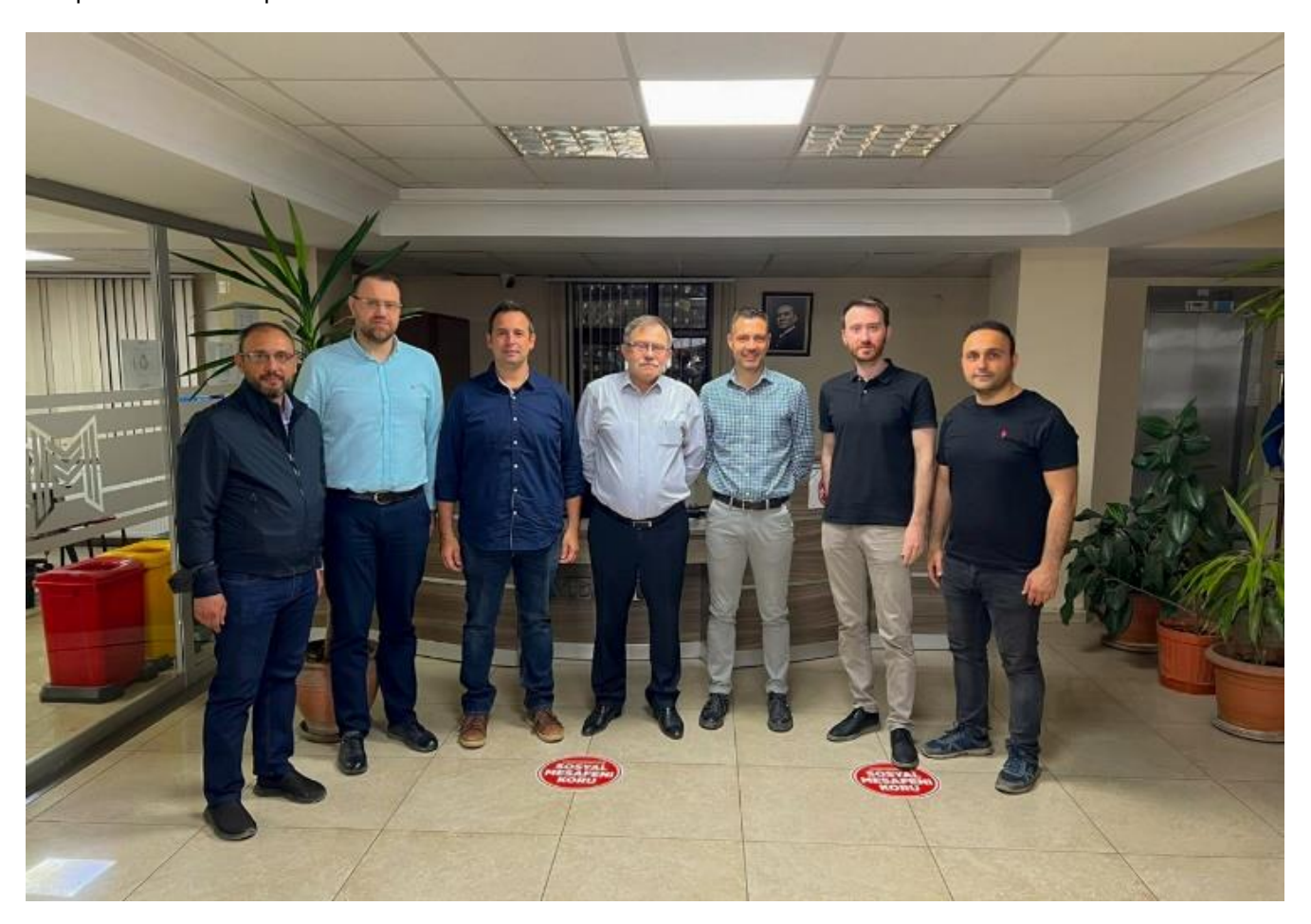
Figure 1 – AIC and MESCIER teams at the contract signing meeting held in Karabuk, Turkey.

The production startup is estimated in 2023.