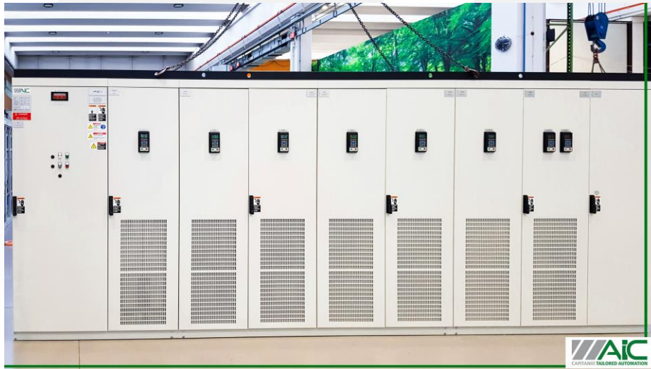
Fig 4 – Auxiliary drives panel