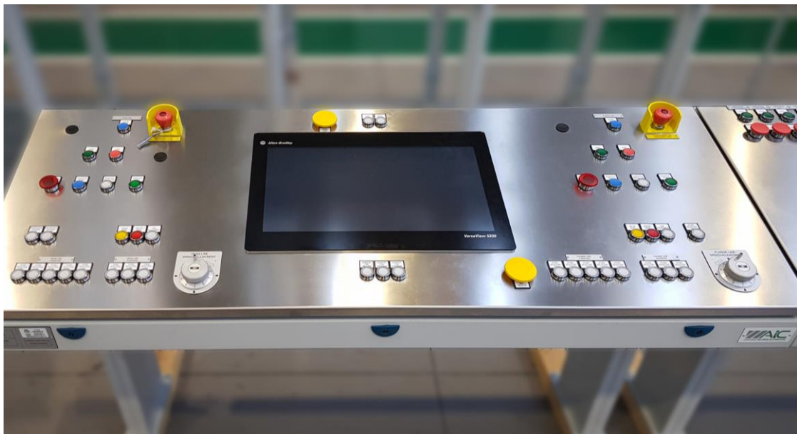
Fig. 1 - Integrated safety/process desk

AiC will be also involved in installation supervision and commissioning phases within the project schedule, at this time schedule for Summer 2020 outage.