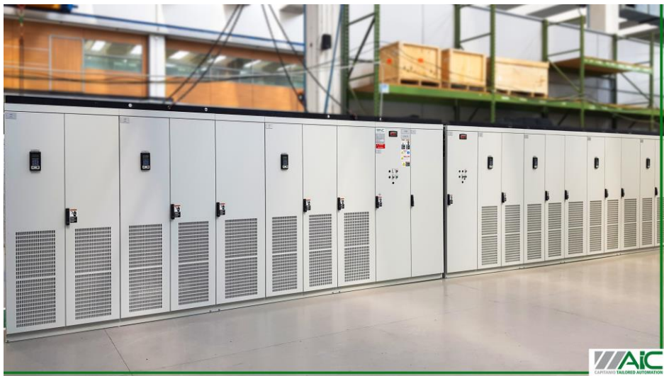
Fig. 5 – Main drives panel

AiC is a global system integrator providing advanced and tailored automation and robotic solutions for the steel industry, with the aim to continuously improve both efficiency, competitiveness and safety of the production processes. With more than 1000 applications worldwide and more than 40 years of history, AiC can boast a unique experience in both greenfield and revamping projects in meltshops and long products rolling mills.