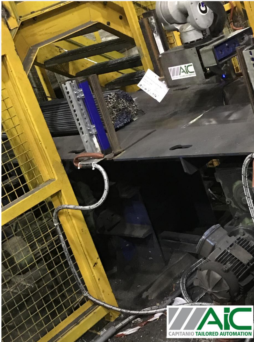
First installation tagging phase

AiC is a global system integrator providing advanced and tailored automation solutions for the steel industry, with the aim to continuously improve both efficiency, competitiveness and safety of the production processes. With more than 1000 applications worldwide and more than 40 years of history, AiC can boast a unique experience in both greenfield and revamping projects in long products rolling mills and continuous casting machines.